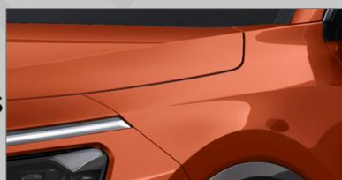
Orange Flame - Standard

All Grades and Powertrains 8 Available Colours